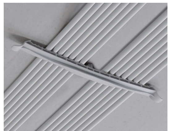
The KB cable brackets have been developed for the section installation of wiring harnesses.

* Listed in product overview order ** for KB 10